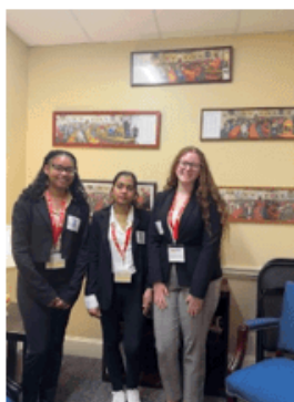
CCBC Student Advocates